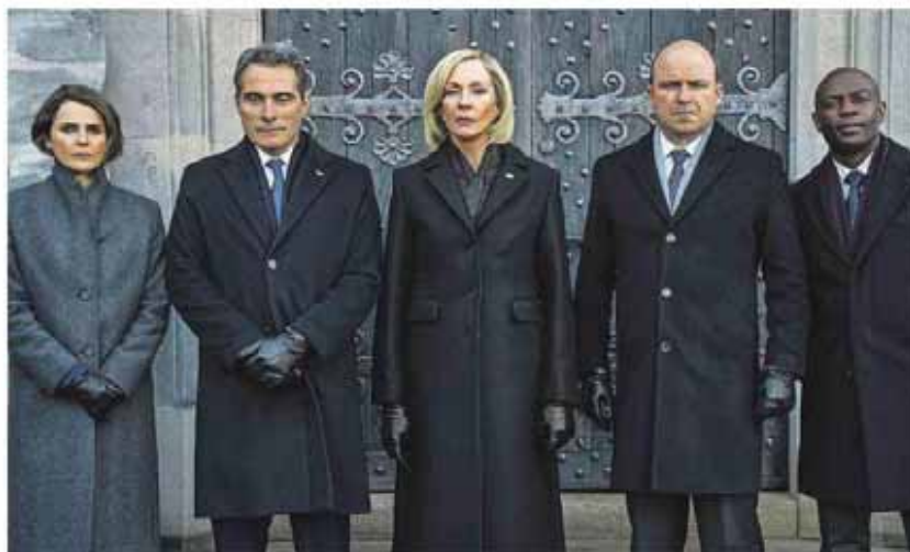
Keri Russell, left, Rufus Sewell, Allison Janney, Rory Kinnear and David Gyasi in the Season 3 finale of "The Diplomat," which was filmed at Planting Fields.